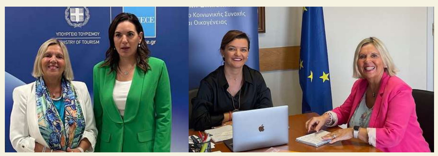
With Greece's Minister of Tourism, Olga Kefalogianni